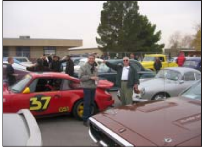
Toy Run 12/16/06